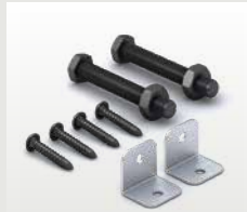
All fixings and brackets supplied