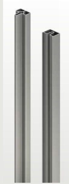
Fence plank starter rail and finishing trim