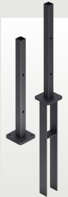
Post supports for both hard and soft surfaces