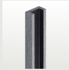
Composite concrete post adapter