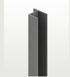
Existing neighbouring fence adapter trim