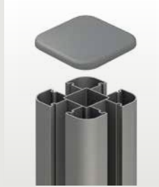
Powder coated aluminium posts and caps